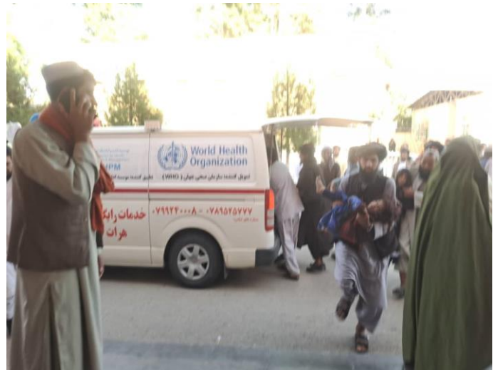
Photo 5: Herat ambulances transferring the victims to the hospitals.