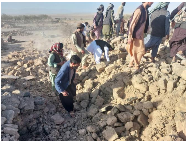
Photo 4: WHO-supported MHTs being deployed in the affected villages in Zinda Jan District.