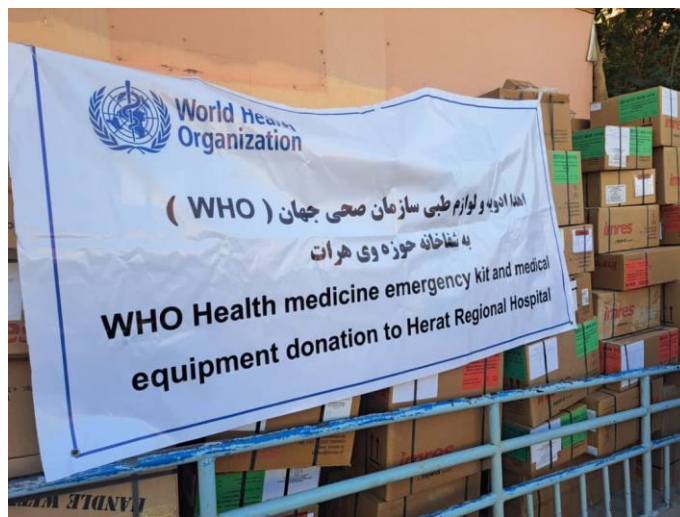
Photo 1: WHO immediately delivered 55 kits of medicine and medical supplies to the regional hospital.

In addition, 12 ambulances were sent to Zinda Jan District and Ghorian District to evacuate casualties to the regional and other hospitals.