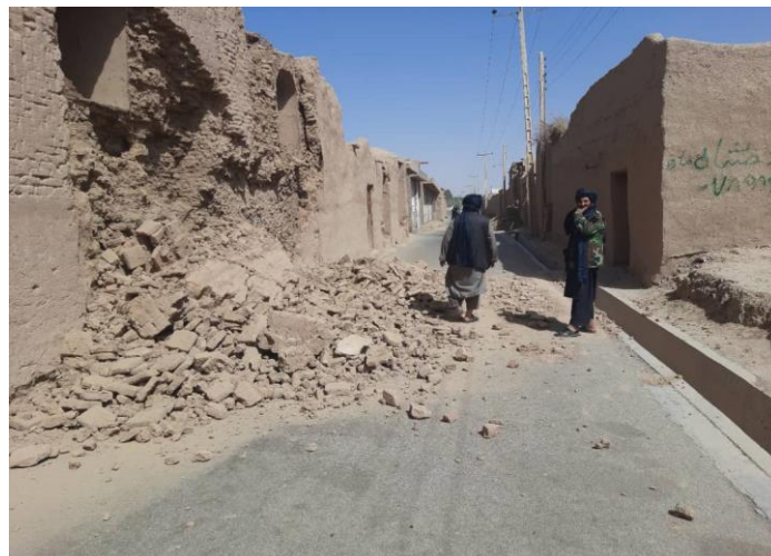
Photo 3: More than 600 houses have been fully and partially damaged.