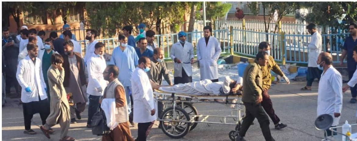
Around 141 people were referred to Herat Regional Hospital after a 6.3 magnitude earthquake occurred in the morning of 11 October

A total of 4,116 people received primary health care including mental health and psychosocial support services (MHPSS); 1,013 individuals were assisted with trauma and rehabilitation services; and 494 people received different kits