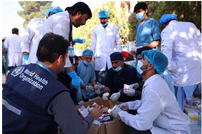
WHO trauma team supporting the mass casualty management at Herat Regional Hospital. in early morning on 11 October.