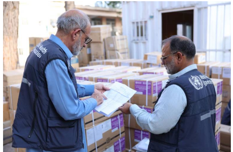
WHO's donation of additional 25 metric tonnes of medical supplies reached Herat on 11 October.