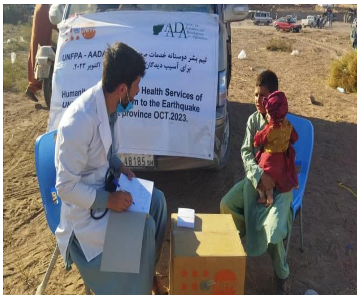
Provision of primary health care services for the affected people of Zindajan district