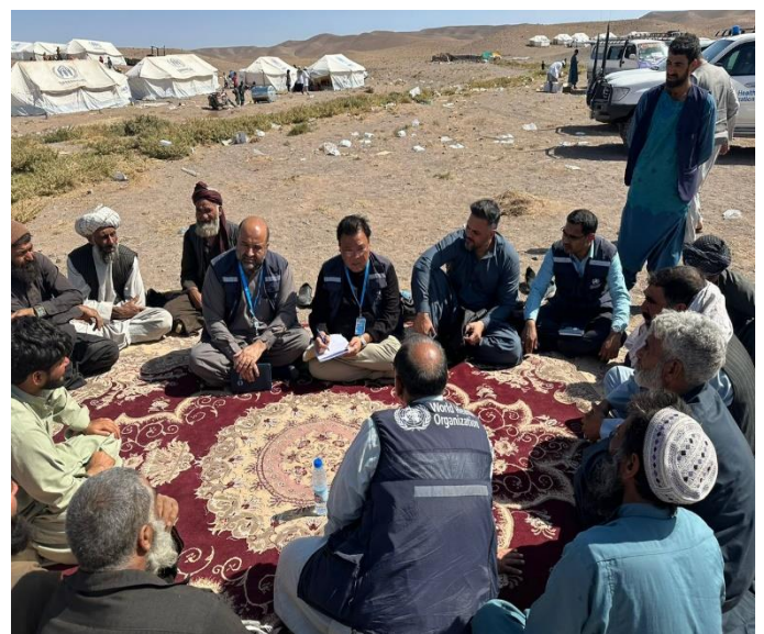
WHO health emergencies team conducting community consultations as part of needs assessment.