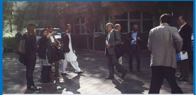
Earthquake hit the country while WHO was discussing the national health emergency response plan with MoH and partners.