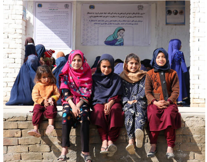
Girls of Mangal ha village, Chahar Dara District, Kunduz Province