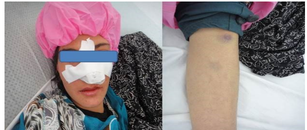
Investigation of a CCHF case in the regional hospital in Herat province

An integrated program for CCHF prevention and control is vital for reducing the economic and health impacts of the disease