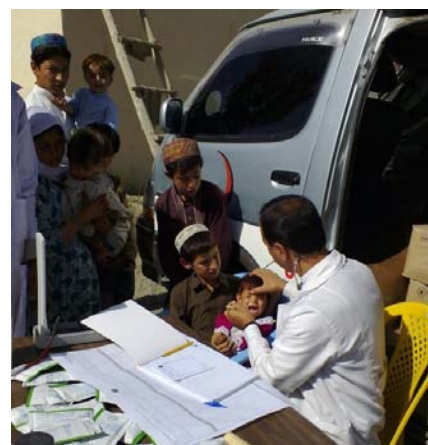
IMC delivers outreach health services to NWA refugees in Paktika's Urgun district