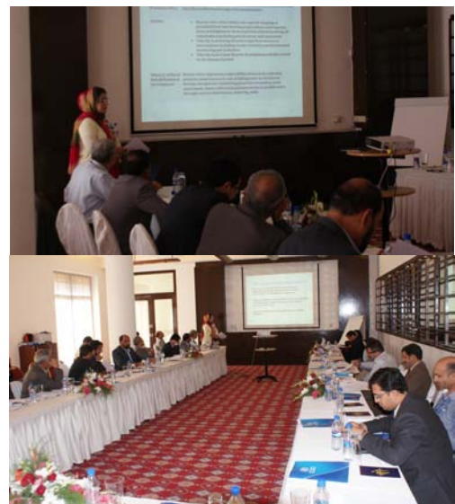
The National Disaster Management Plan was finalized in September at an event in Kabul under the leadership of Deputy Minister of Public Health Dr Najia Tariq