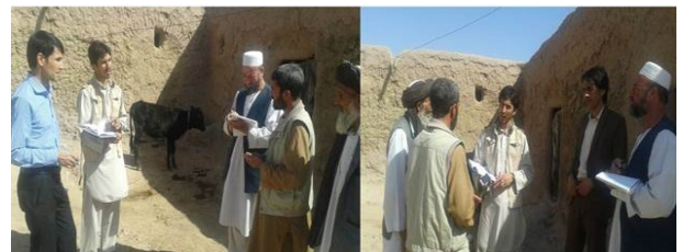
Field investigation of a CCHF case in Pashtan village in Herat's Karukh district in September