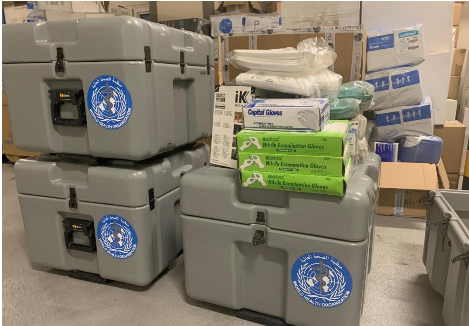
WHO's logistics hub in Dubai has delivered COVID-19 supplies across all six WHO regions