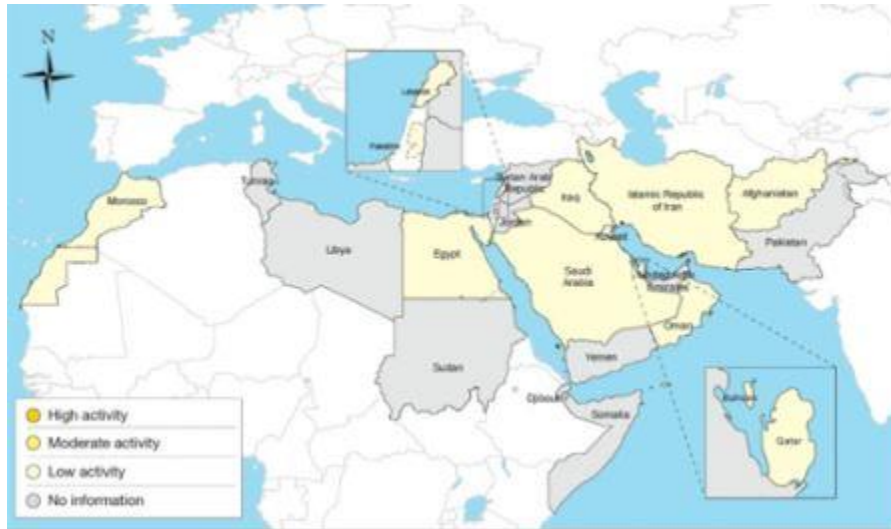
Fig. 1. Influenza activity in the Eastern Mediterranean Region, June 2017

In the WHO Eastern Mediterranean Region, influenza activity remained low in June 2017 in countries reporting data to FluNet and EMFLU namely, Afghanistan, Bahrain, Egypt, Islamic Republic of Iran, Iraq, Lebanon, Morocco, occupied Palestinian territory, Oman, Qatar and Saudi Arabia (Fig. 1). All seasonal influenza subtypes were detected in the Region.