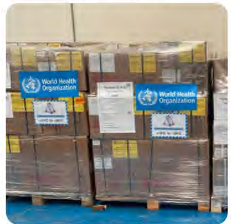
A WHO-procured shipment of chronic diseases kits at Dubai Hub on its way to South Egypt