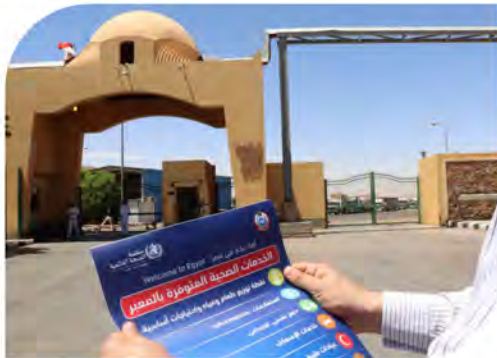
Some of the WHO and MoHP information materials on the available health services at the borders