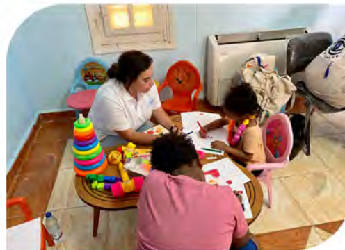
WHO and MoHP Mental Health and psychosocial support clinic at Karkar Station