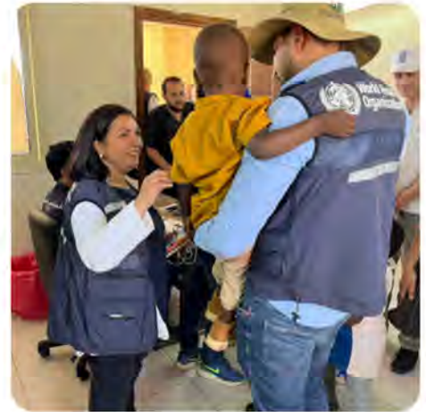
WHO Rep. in Egypt assessment visit to the borders