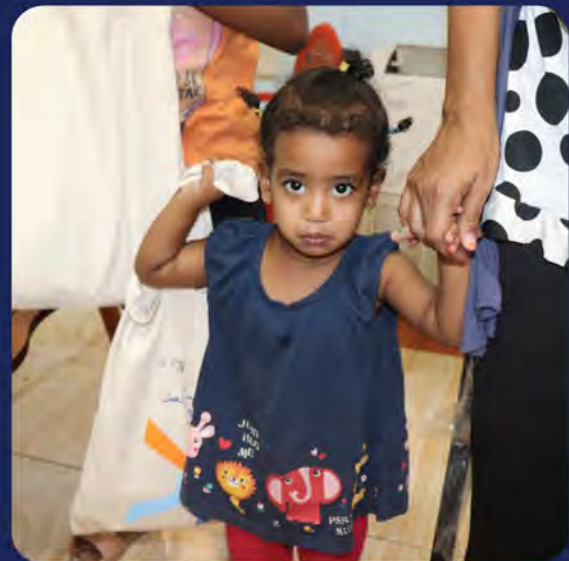
A Sudanese child and her mother at a WHO mental health clinic located inside Karkar Station in Aswan

US$ 5 MILLION REQUIRED TO SUPPORT WHO'S RESPONSE IN EGYPT