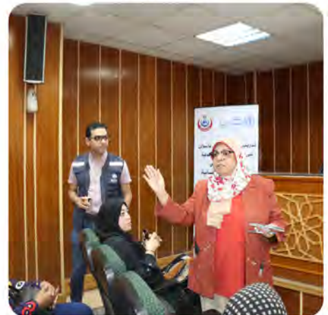
WHO training at Aswan on the health response to gender-based violence