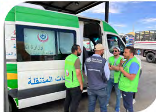
MoHP mobile clinic at Qustul border