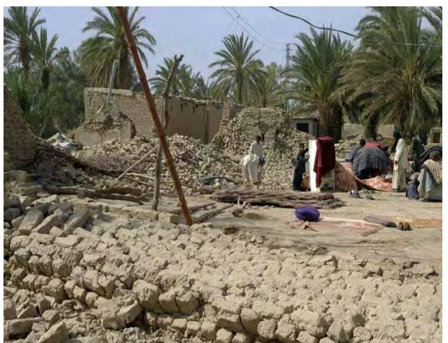
Houses damaged/destroyed as a result of earthquake in Awaran