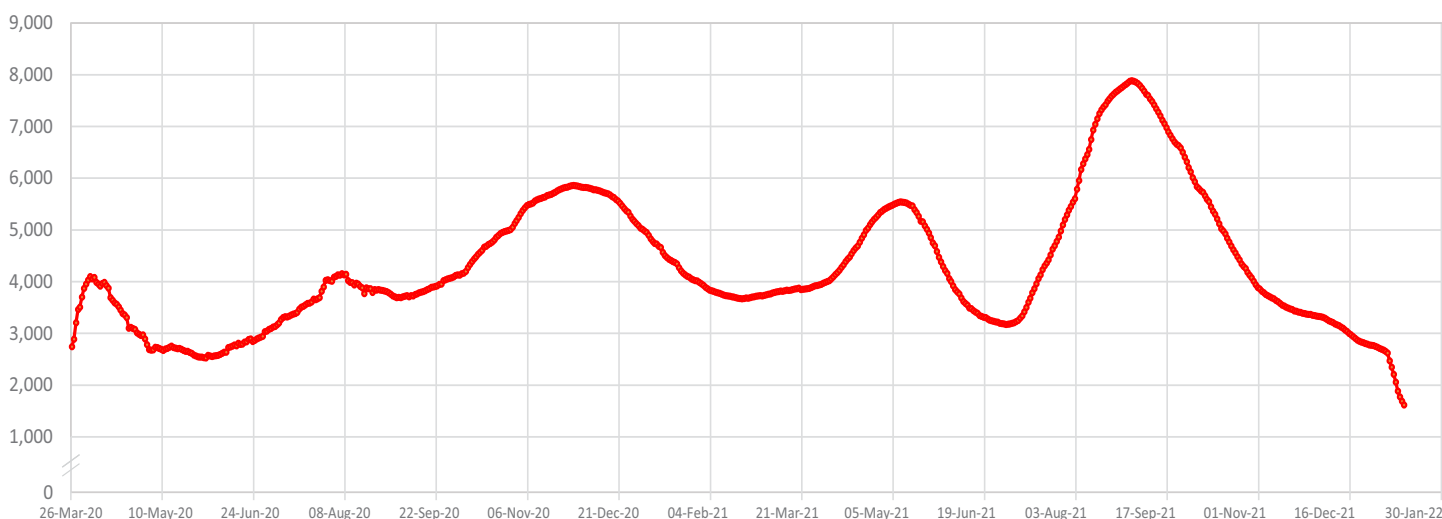
Figure 2 - COVID-19 Patients in Intensive Care, 26 March 2020 - 11 January 2022

Number of cases admitted to ICU: 1,619 ↓(-73)