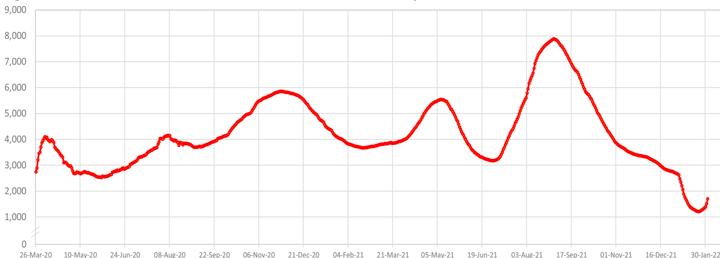
Figure 2 - COVID-19 Patients in Intensive Care, 26 March 2020 - 01 February 2022

Number of cases admitted to ICU: 1,703 ↑(+191)