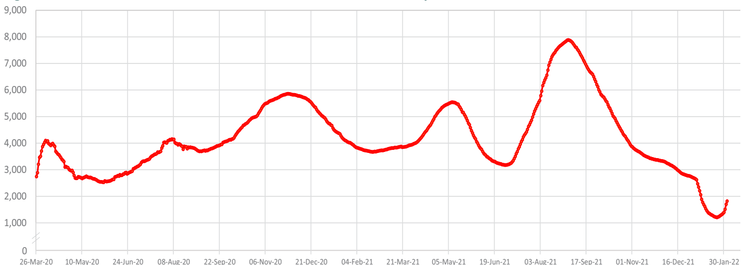
Figure 2 - COVID-19 Patients in Intensive Care, 26 March 2020 - 02 February 2022

Number of cases admitted to ICU: 1,819 ↑(+116)