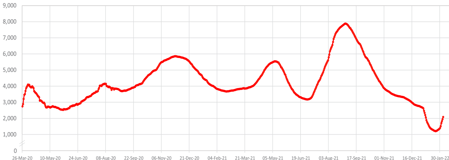
Figure 2 - COVID-19 Patients in Intensive Care, 26 March 2020 - 04 February 2022

Number of cases admitted to ICU: 2,085 ↑(+140)