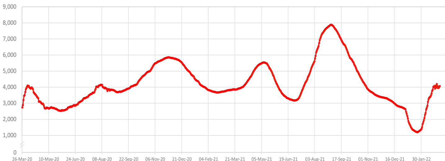
Figure 2 - COVID-19 Patients in Intensive Care, 26 March 2020 - 02 March 2022

Number of cases admitted to ICU: 4,066 ↑(+39)