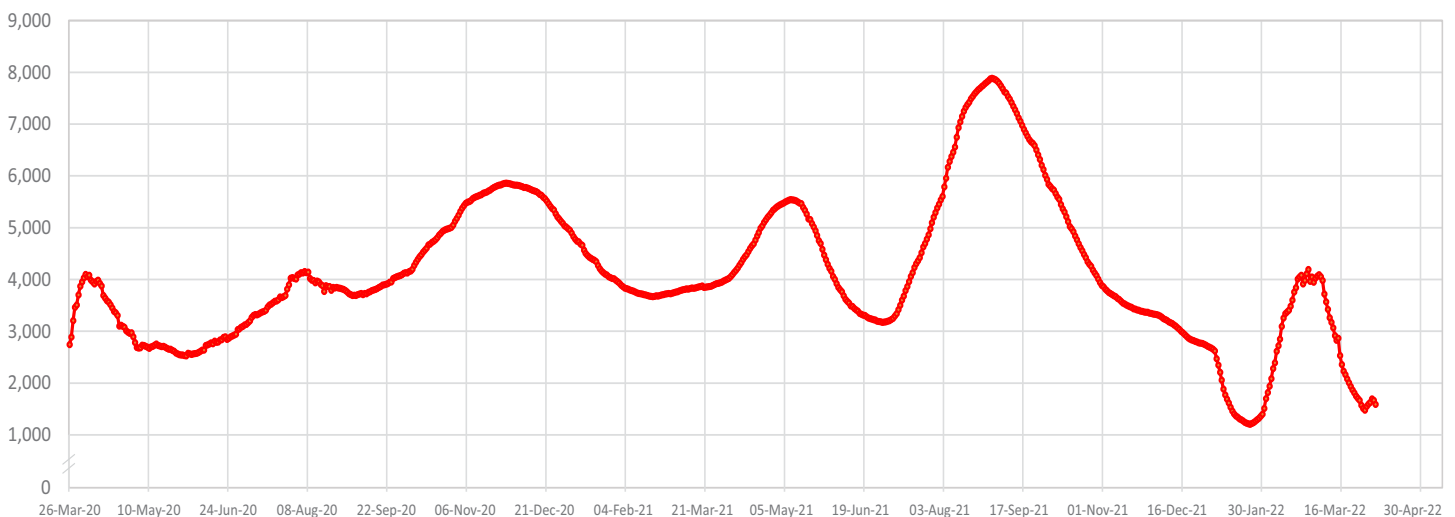
Figure 2 - COVID-19 Patients in Intensive Care, 26 March 2020 - 04 April 2022

Number of cases admitted to ICU: 1,591 ↓(-76)