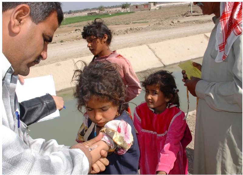
PHOTO 1 MOH TEAM PROVIDES VACCINES FOR CHILDREN IN BAGHDAD DURING AN IMMUNIZATION CAMPAIGN IN 2010

The government's decision to introduce Hib vaccine will protect thousands of infants against some of the most dangerous childhood infections, including the major causes of diarrhea and the major causes of pneumonia and meningitis that is known to lead to permanent neurological disabilities. This decision comes after more than three years of day and night preparations to start a new chapter in the history of the EPI programme in Iraq.