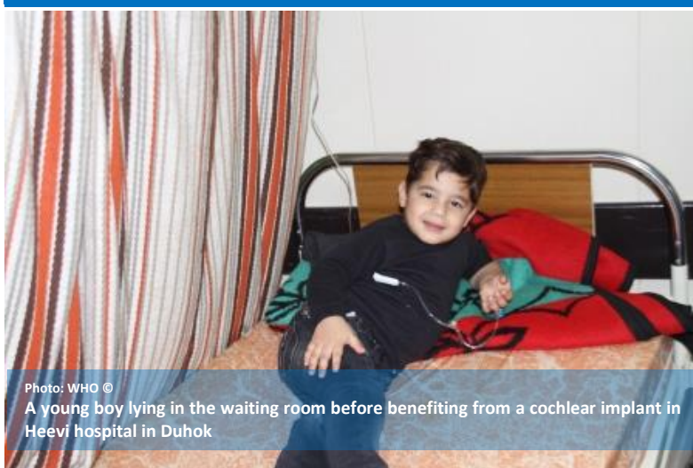
A young boy lying in the waiting room before benefiting from a cochlear implant in Heevi hospital in Duhok