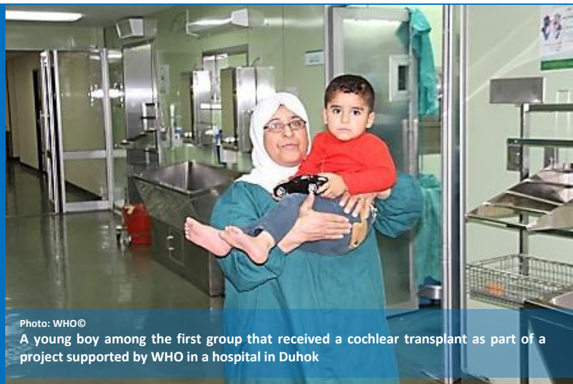
A young boy among the first group that received a cochlear transplant as part of a project supported by WHO in a hospital in Duhok