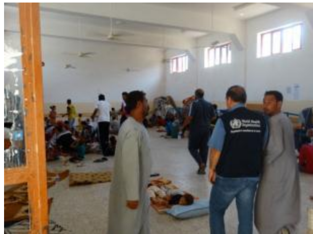
IDPs sleeping on floor in a school building in Khanek, Dohuk WHO visit to Khanek Collective Town, Dohuk-KRG- 5 August 2014

In Dohuk, 150 health facilities are functioning including 29 hospitals (17 specialized and 12 general). However, the load on these facilities is resulting in acute shortage of medical staff and medicines and medical supplies. A list of essential drug needs has been prepared by Dohuk DOH and shared with WHO for support.