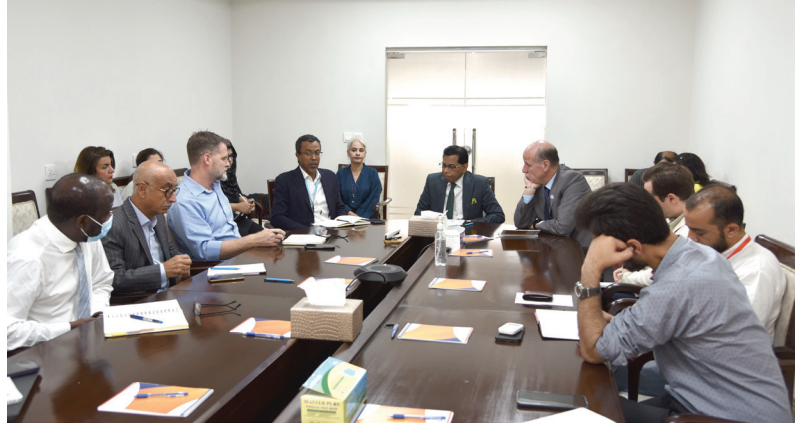
Health Partner Meeting on Tropical Cyclone "BIPARJOY" at WHO Pakistan Country Office, dated 13 June, 2023

2. WHO has prepositioned medicines and medical supplies at Karachi. Additional medical kits have been dispatched to Karachi to support response to the "BIPARJOY" cyclone.