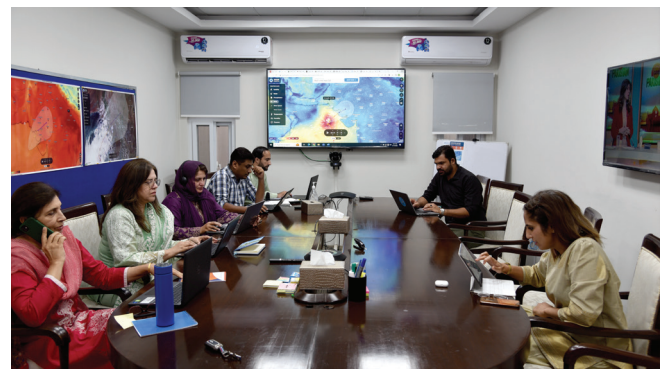
WHO staff working at the SHOC rooms at WHO Country Office Islamabad