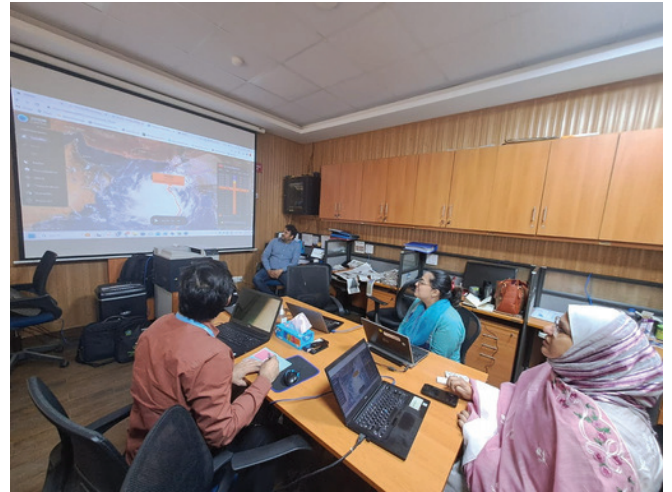
Provincial Sub Office staff working at SHOC room in WHO Karachi office