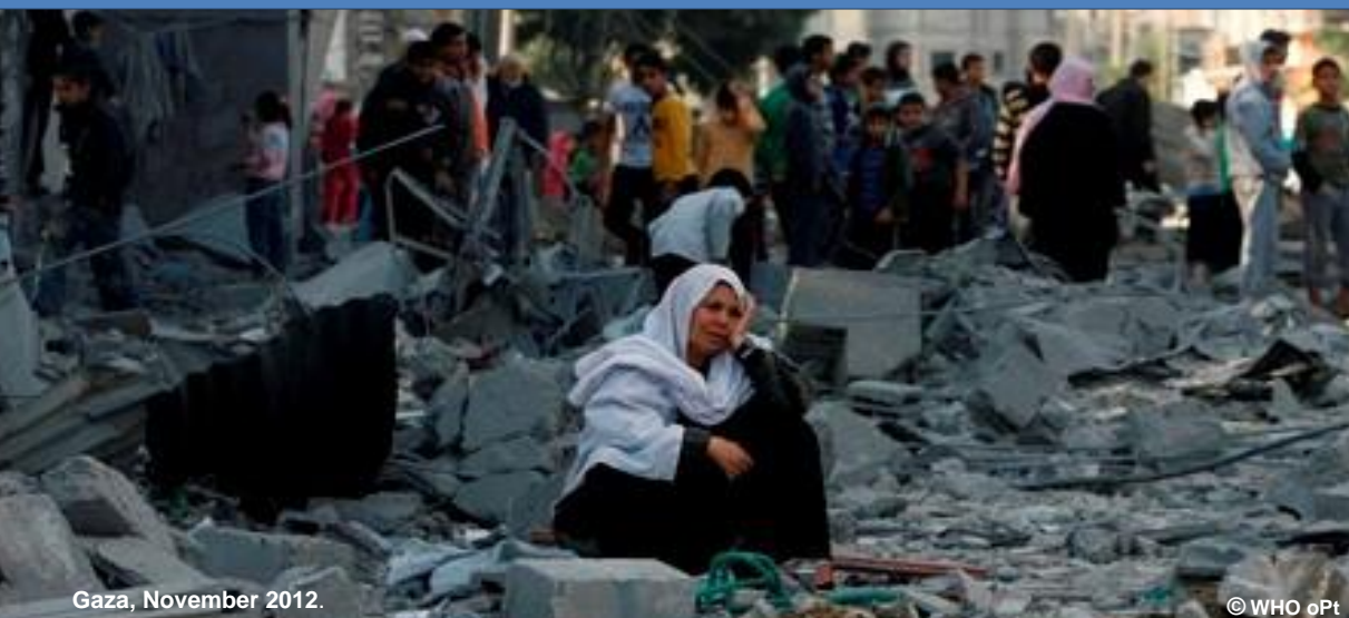
Gaza, November 2012.