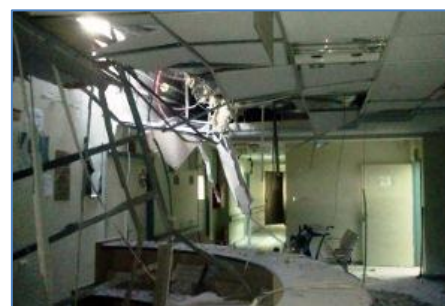
Jordanian Field Hospital November 19, 2012

In November, 88% of Israeli permit applicants were referrals financially covered by MoH. The rest were covered by different sources ( Table 3 ). Out of the 725 patient applications, 87% (629 patients) were approved permits. 5 male patients were denied permits to cross Erez. Four of these patients had appointments in East Jerusalem hospitals and one in a West Bank hospital. Thirteen patients (2 females and 11 males) (1.8%) were requested to appear for security interviews with the Israeli GSS as a precondition to process their application; 2 of those requested were over 60 years of age). Of the 13, only 2 patients were issued a permit following interrogation ( Table 4 ).