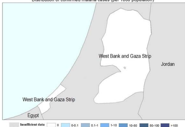
Distribution of confirmed malaria cases (per 1000 population)

Occupied Palestinian Territory is free from local malaria transmission and has 0.0% of reported cases of the malaria-free countries. The last local case was in 1965.