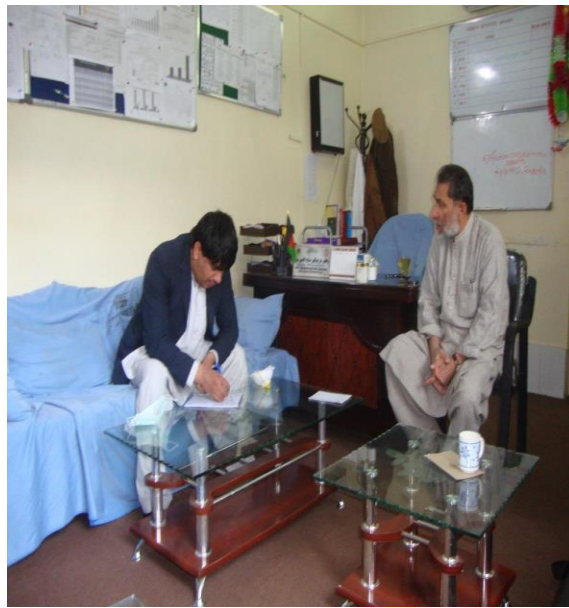
PI taking interview from chief of TB ward in his office