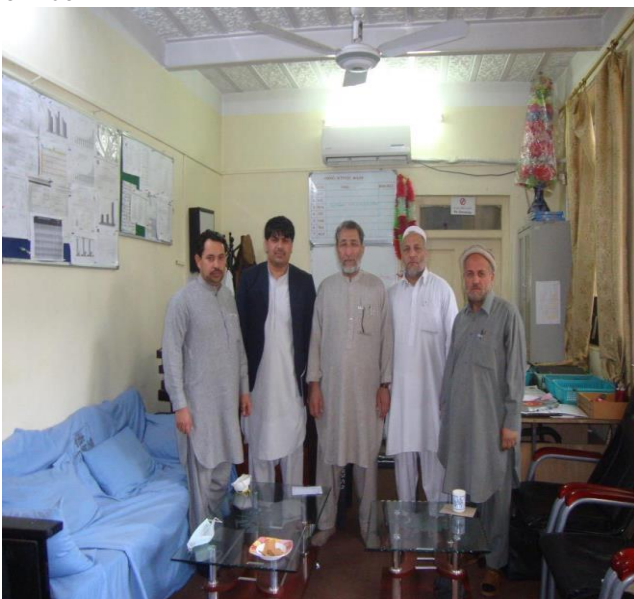
PI with TB specialists in their office