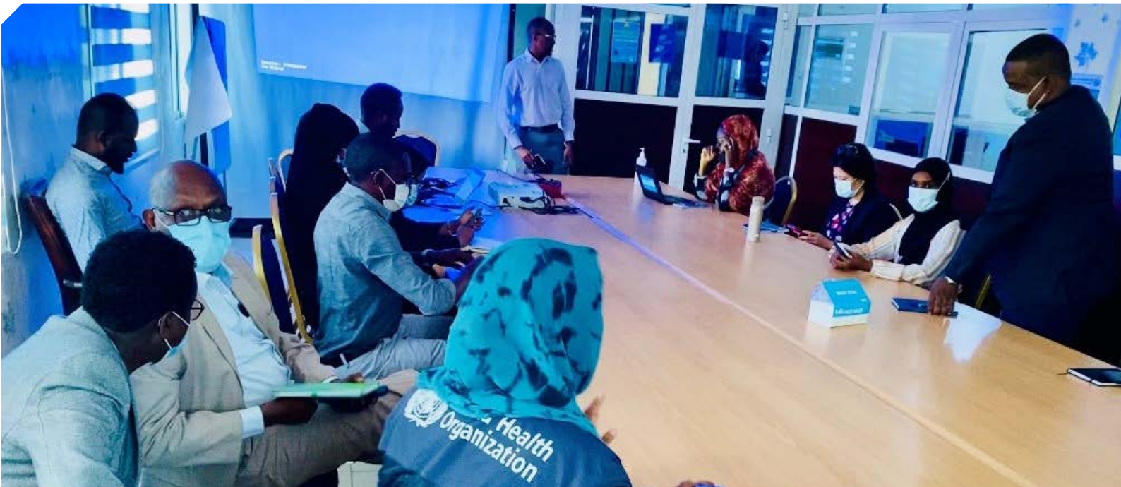
WHO and the Ministry of Health in Somaliland conducted a health emergency coordination meeting in Hargeisa, February 2022