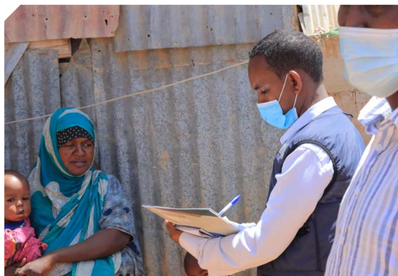
WHO and the MOH in Puntland investigating a measles outbreak at a health centre in an internally displaced persons' camp, February 2022