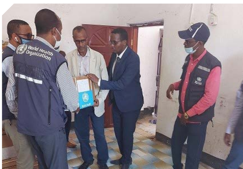
A WHO technical mission visiting Jubaland state to support a health situation assessment for the ongoing drought, February 2022