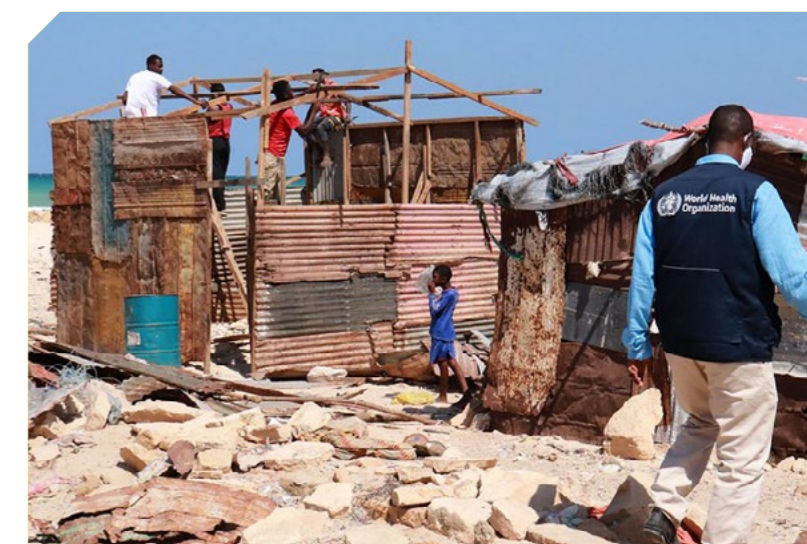
A WHO staff surveys the damage from Cyclone Gati