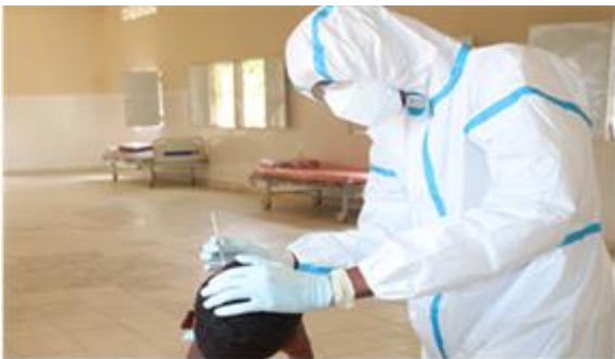
Suspected COVID-19 swab sample collection in Baidoa isolation center on daily basis on 30 June 2020