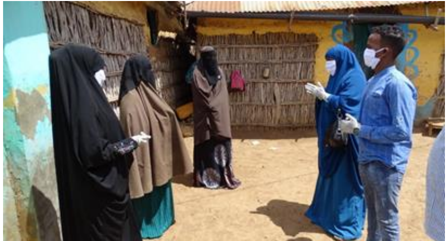
Community Mobilizers and DFAs carrying out house-to-house COVID-19 surveillance and awareness activities in Hanti-wadag, Jowhar town