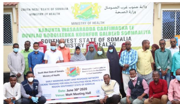
Early warning alert and response network cascade training for health facilities in Bay region on 30 June 2020