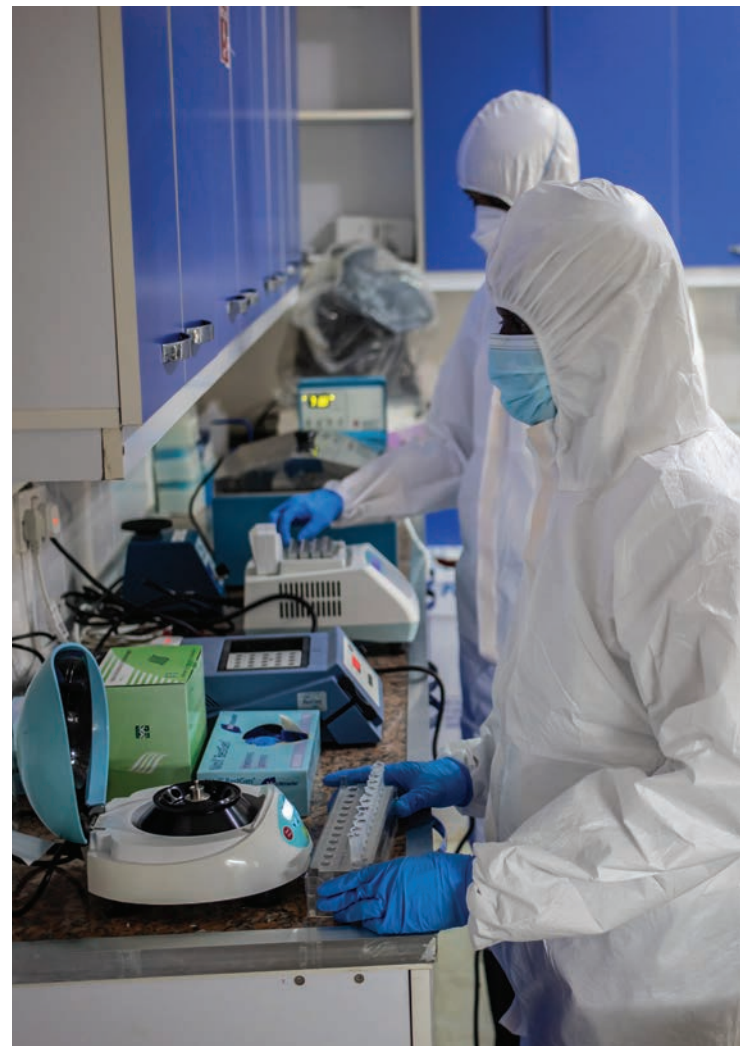
The public health laboratories supported by the Global Affairs Canada have contributed to improving national health security in Somalia. The laboratories continue to play a critical role for enhancing epidemic preparedness and readiness by testing and detecting emerging and re-emerging pathogens circulating in the country

With the real-time PCR machines, Somalia can now test for influenza, dengue fever, chikungunya, mpox and other viruses. These laboratories will continue to have the potential of leaving a lasting and positive impact on the Somali health sector as they will have the capacity to test and detect various other types of epidemic-prone diseases in the future.