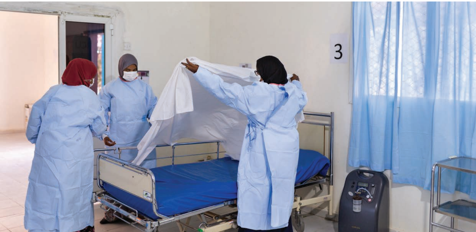
WHO's vision of building a resilient health system to improve access to quality health care for all during the COVID-19 pandemic would not have been possible without the generous contribution received from the Global Affairs Canada.