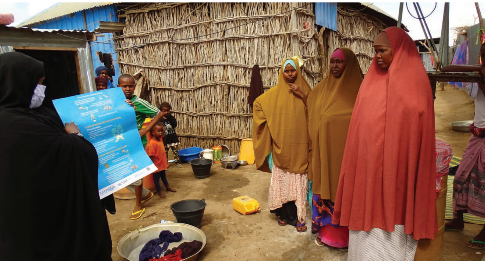
The community health workers deployed by WHO were the unsung heroes of Somalia's response to COVID-19 pandemic at the frontline. Their work supported by the Global Affairs Canada helped mitigate risk and prevent spread from SARS-COV-2 infection at the communities who were living in marginalized settings.

functions of the IMS teams were largely guided by the National Preparedness and Response Plan for COVID-19 in Somalia. Additionally, WHO facilitated weekly UN COVID-19 Task Force meetings and Health Cluster Coordination meetings for nongovernmental organizations, implementing partners and women's rights organizations. WHO was also the lead agency for the UN Inter-Agency Coordination Committee and the executive crisis management team set up by the Designated Official of the UN System in Somalia. WHO and FMOH also jointly produced weekly epidemiological situation reports, monthly infographics and numerous risk assessments. These materials provided in-depth descriptions of the COVID-19 epidemic's characteristics at national and state levels, which supported evidence-based decision-making and enabled WHO to develop targeted COVID-19 emergency response plans and interventions to guide collective response efforts.