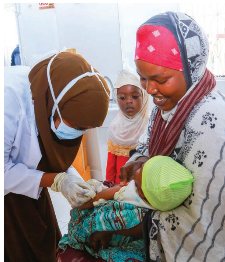
The support of Global Affairs Canada ensured that essential health services continue to be delivered to the vulnerable populations across the country. Any disruption would have had a catastrophic impact on the lives of mothers and children in such a fragile setting.

WHO partnered with other actors to augment essential health care services, which allowed immunization services, essential newborn care, care for pregnant and lactating women, and other routine primary health care services to resume normally during the pandemic.