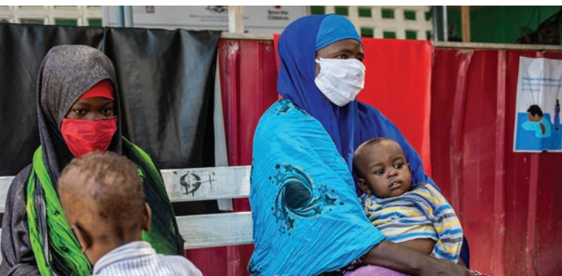
The partnership between Global Affairs Canada and WHO helped the health care facilities in Somalia to function optimally during the COVID-19 pandemic. WHO ensured that essential supplies and drugs are available in all health care facilities enabling mothers and children to access essential health care everywhere.

Overall, Global Affairs Canada's support helped WHO to strengthen COVID-19 preparedness and response, as well as reduce COVID-19-related morbidity and mortality by improving national and state level coordination and planning; establishing an integrated disease surveillance and response system (IDSRS) and launching the first ever Frontline Epidemiology Training Program (FETP) to detect and respond to health risks; expanding the Early Warning Alert and Response Network (EWARN); deploying community health workers (CHWs) and rapid response teams (RRT); establishing laboratory capacities; and providing supplemental oxygen therapy to patients. All of these strategies proved critical for saving lives.