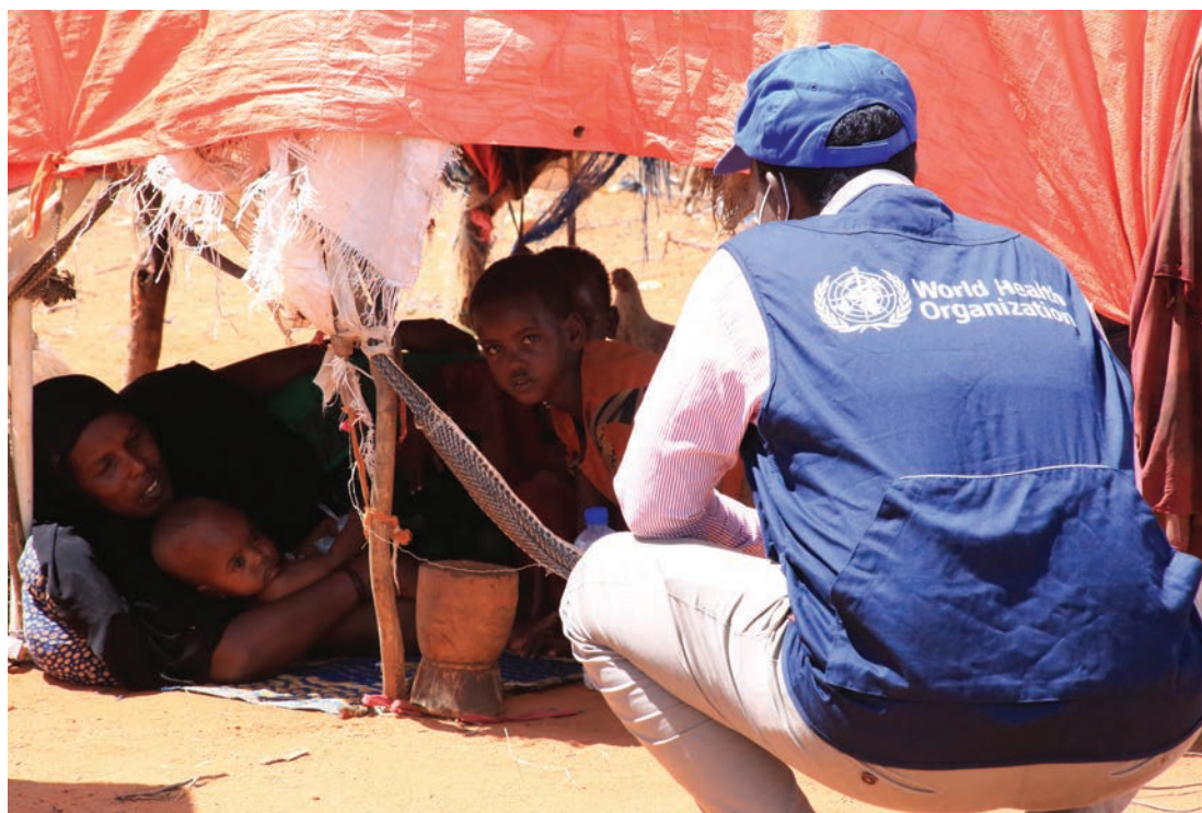
During the pandemic, WHO deployed its own frontline staff to track and monitor the health of all close contacts irrespective of their place of living to ensure no one is left behind for contact tracing and case identification.

The CHWs identified more than double the close contacts than those identified by EWARN health facilities. The efforts were aimed at preventing the spread of COVID-19 in vulnerable communities and ensuring that adequate care was provided to those affected. The key roles played by CHWs and RRTs in detection of COVID-19 cases and reducing the spread of the disease among the vulnerable populations in a weak and fragile system cannot be overstated.