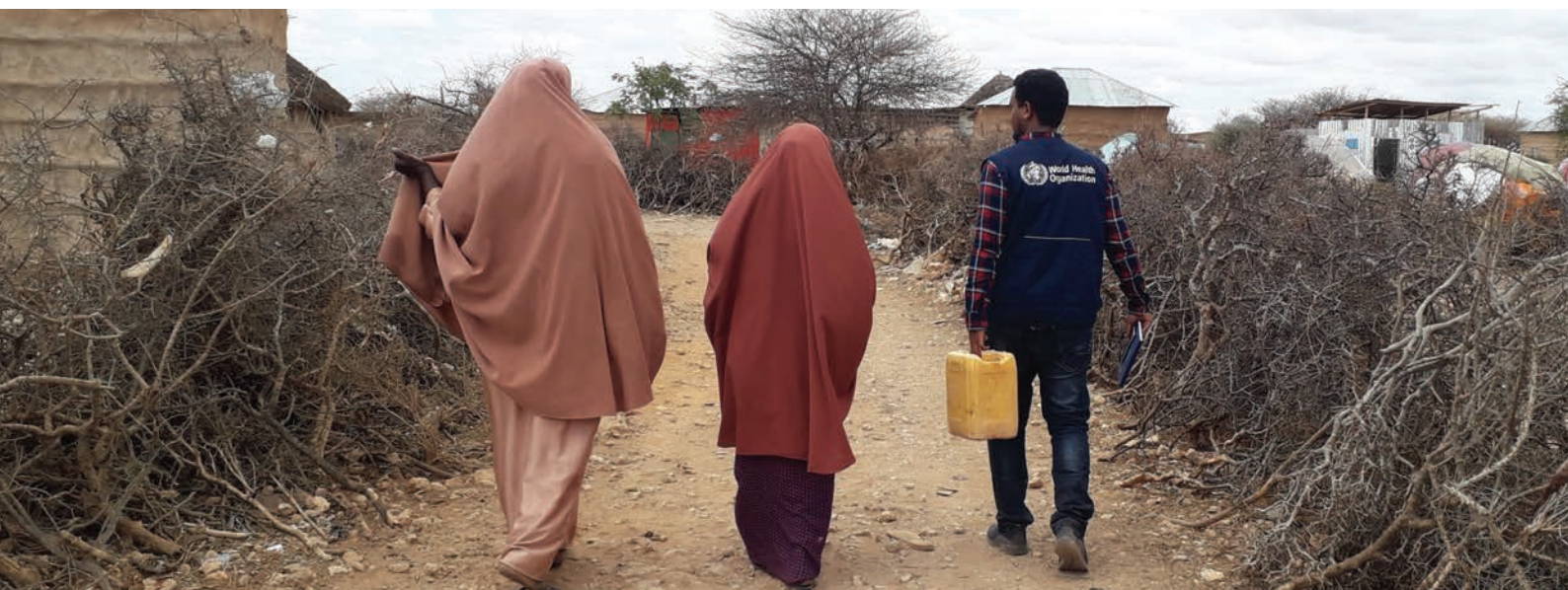
Identifying, tracking, and tracing any suspected case of SARS-COV-2 infection and close contacts in rural and peripheral areas were a challenge owing to inaccessibility and geographic distance. WHO worked with the local community and community health workers to overcome these barriers.

To further strengthen surveillance for public health events, Somalia established the frontline FETP, a three month in-service training programme to build the capacity for 'disease detectives'. The frontline FETP aims to strengthen the detection of and response to diseases and events of public health importance or international concern, as well as equip frontline health teams with skills to generate quality surveillance data and to use this data for public health action. Initial funds to establish the programme were derived from the Canadian support. A total of four cohorts have completed the training with 95 (30 female) frontline health workers graduating.