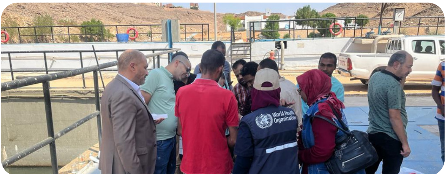
Water testing practical training at Aswan

healthcare workers trained on strengthening the IPC and waste management practices