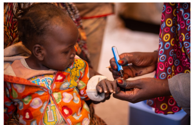
A child living in a camp for internally displaced persons has her finger marked after vaccination.