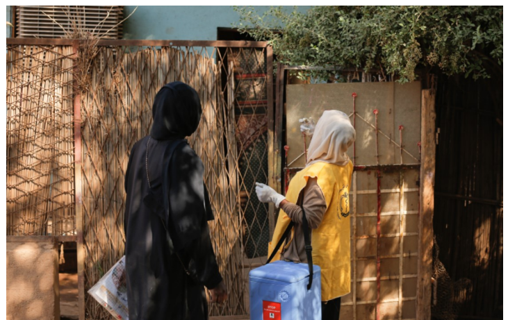
Vaccinators provide polio vaccines and knock on doors in Khartoum city on the first day of the campaign.