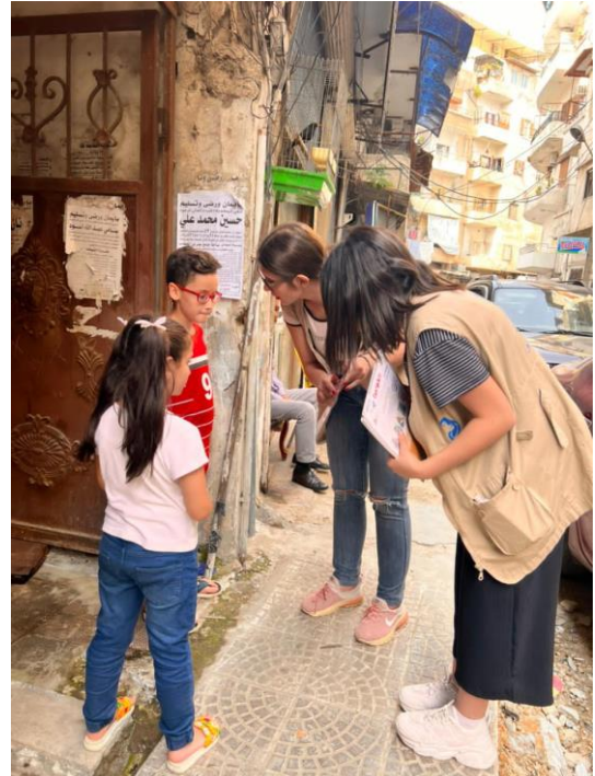
WHO supported mobile teams raising awareness of cholera and general health promotion