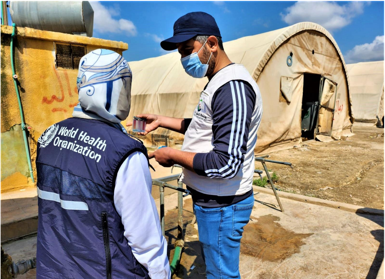
WHO and Assistance Coordination Unit testing quality of water in Northwest Syria.