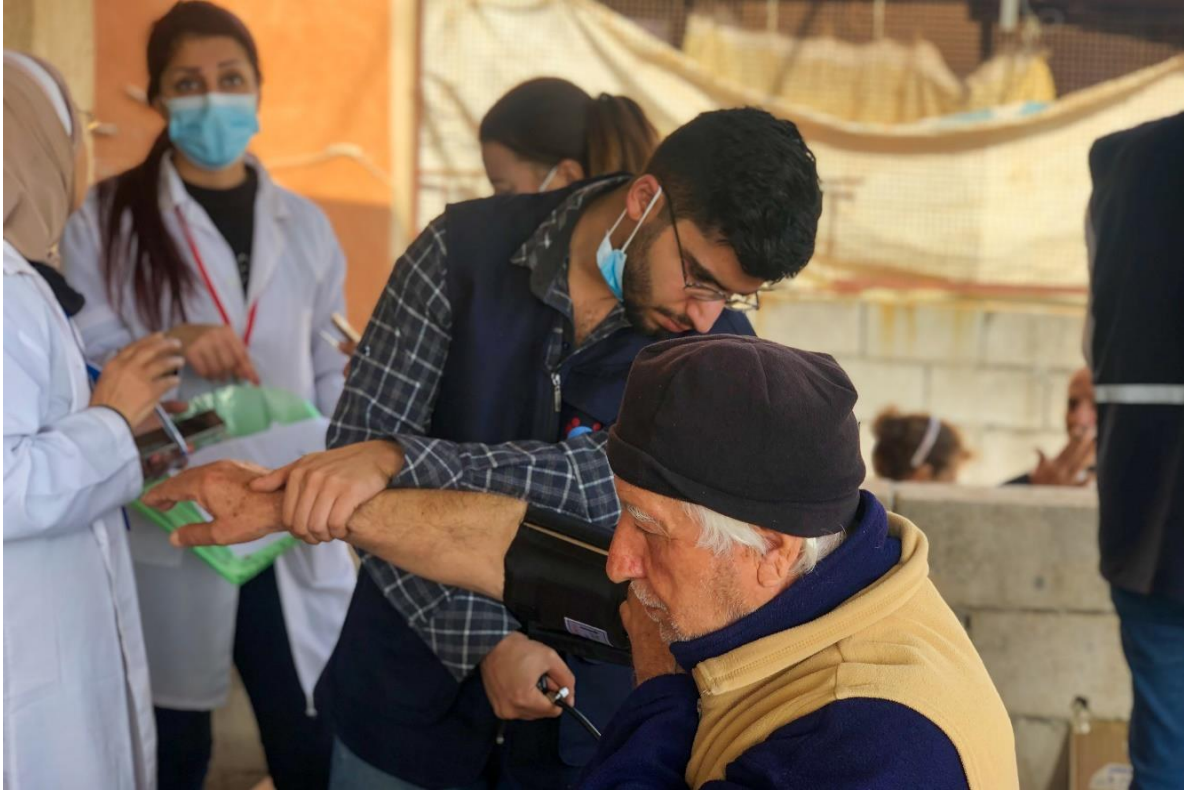
WHO-supported mobile teams providing healthcare in Latakia @WHO