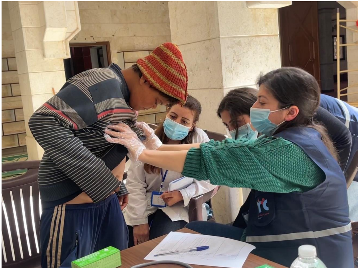
WHO-supported mobile teams providing healthcare in Latakia