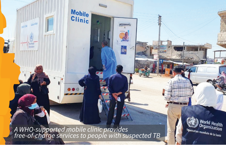
A WHO-supported mobile clinic provides free-of-charge services to people with suspected TB

WHO, the Global Fund and the International Organization for Migration (IOM) have been working closely to address the HIV and tuberculosis (TB) epidemics through the Middle East Response (MER) project. As the protracted crisis in the Syrian Arab Republic has severely affected the health system countrywide, WHO, through the MER1 grant, is supporting three National Tuberculosis Programme (NTP) mobile clinics in Aleppo, Rural Damascus and Deir-ez-Zor governorates.